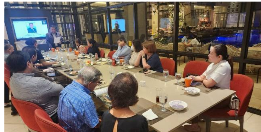
52 nd Charter Day Anniversary Dinner Celebration, Jan . 20, 2024