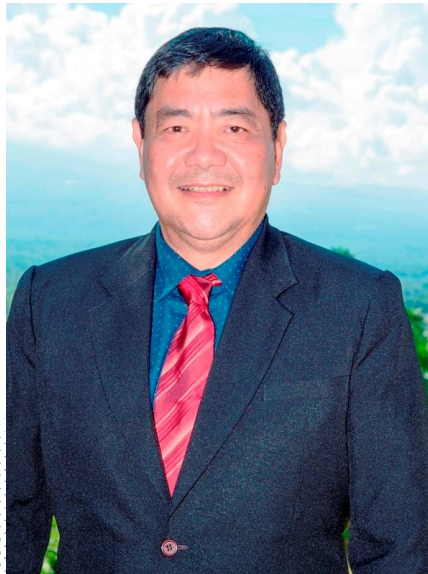
PDS Abo Gempesaw